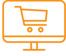
# of Items