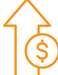
Marketing and Promotions