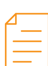
# of Invoices