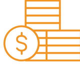
Tie Out Aging To Trial Balance