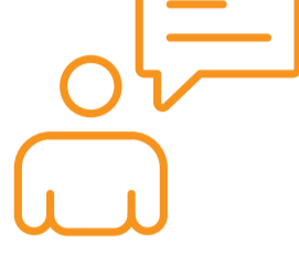
Enhance Transaction Communication