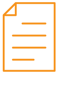
Close The Books Reports