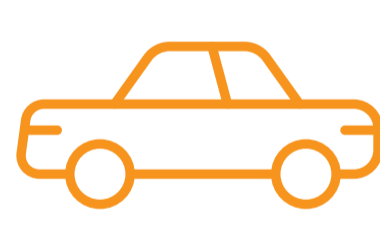
# of Vehicles