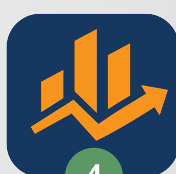
Figure Out How To Keep The Kitchen Busy