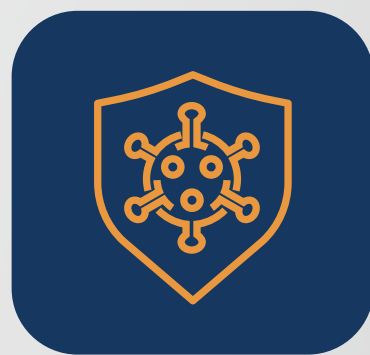
D. Other Preventive Measures As Released