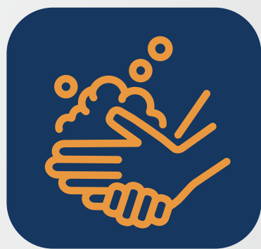
A. Frequent Washing Of Hands