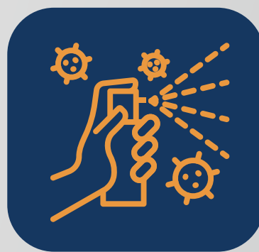
F. Frequent Disinfecting Of Surfaces