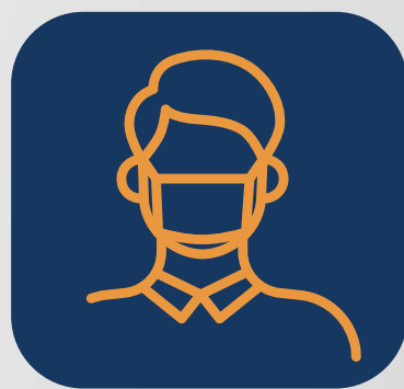
B. Use Of Masks